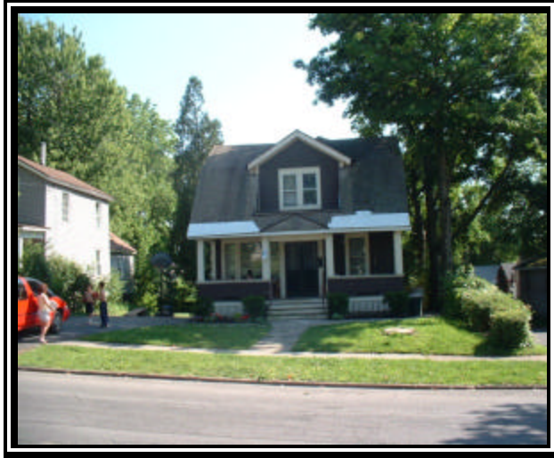
511 Second North Street