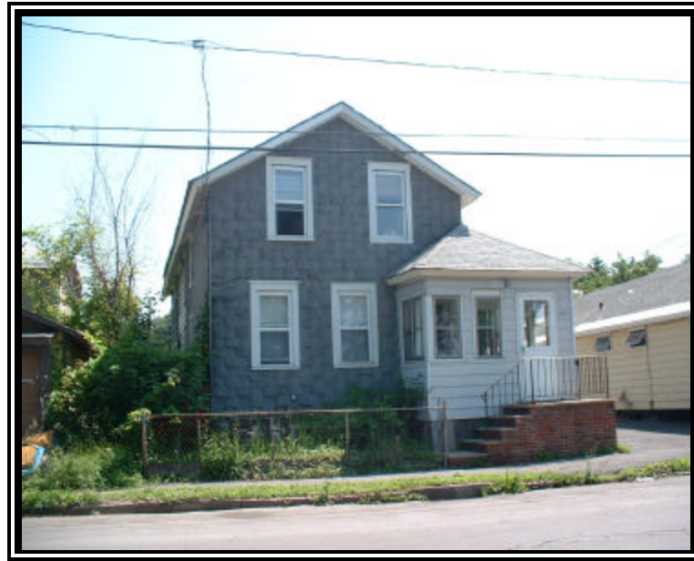
306 Basin Street

Because of the similarity of the names of the first-born male children, the fact that they all lived in the same area near Puckane, moreover they acted as sponsors for each other's children, and they worked at the same trade in the same area in Syracuse - it seems safe to assume that all were members of the same family. The following chart sets out the re-