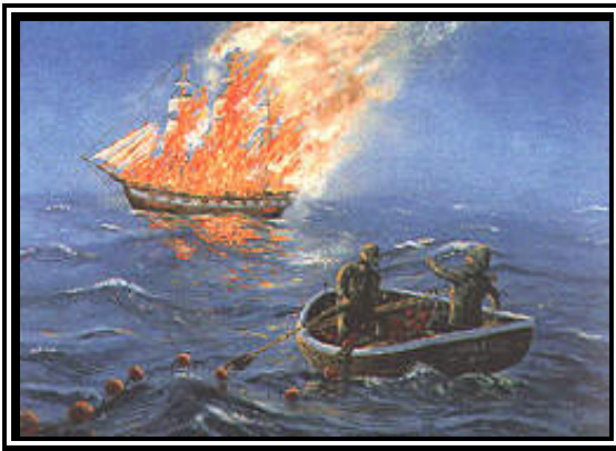
"The Phantom Ship" - Vetta LaPointe Faulds

As the Belledune community lies along the shore of the Bay of Chaleur, many older residents tell of sighting the renowned Phantom Ship - or as it is sometimes called - "The Burning Ghost Ship". The stories vary from community to community along the bay and versions differ, depending on which community sighted the apparition. Theresa says the most common version she has heard is as follows;